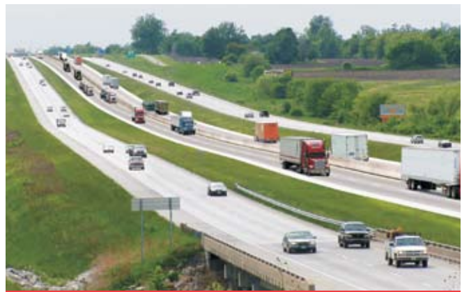
Concept Drawing of Truck Only Toll Lanes on I-70 in Missouri.

Tolling is a user fee approach, as wildly unpopular a funding approach with most consumers as a gas tax increase. Tolling might become more appealing, however, when considered alongside the true costs of food transport. The Truck Only Toll lane (TOT) is one type of tolling scheme currently under consideration in the US by